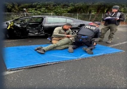
Officers being evaluated during Patrol Tactics Equivalency Academy (WSCJTC)

Total Number of Instructors trained from 2017 to 2024 = 695