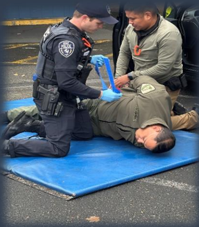
Officers are trained on proper application of the tourniquet

Patrol Tactics Regional Hub – A regionally located venue that has certified instructors and has been certified to host PTI, PTIS, and PTIR courses. Regional hubs are supplied with the needed training equipment by WSCJTC. The equipment is available for loan to smaller agencies located within the region that may need training materials to train their personnel.