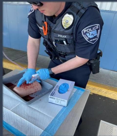
Officers uses gauze to learn wound packing during Critical Life Saving Skills training