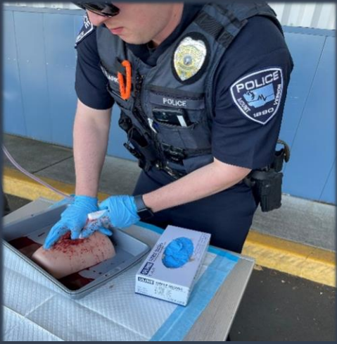
Mt. Vernon Officer uses gauze to learn wound packing during Critical Life Saving Skills training.

E2SHB 1310 | JANUARY 2024 - JUNE 2024 | REPORT P A G E | 5