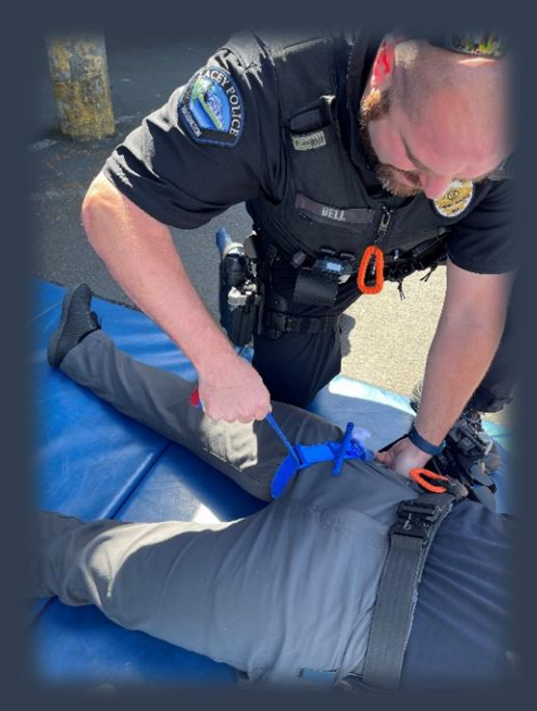
Lacey Police Officer trains in the application of the tourniquet