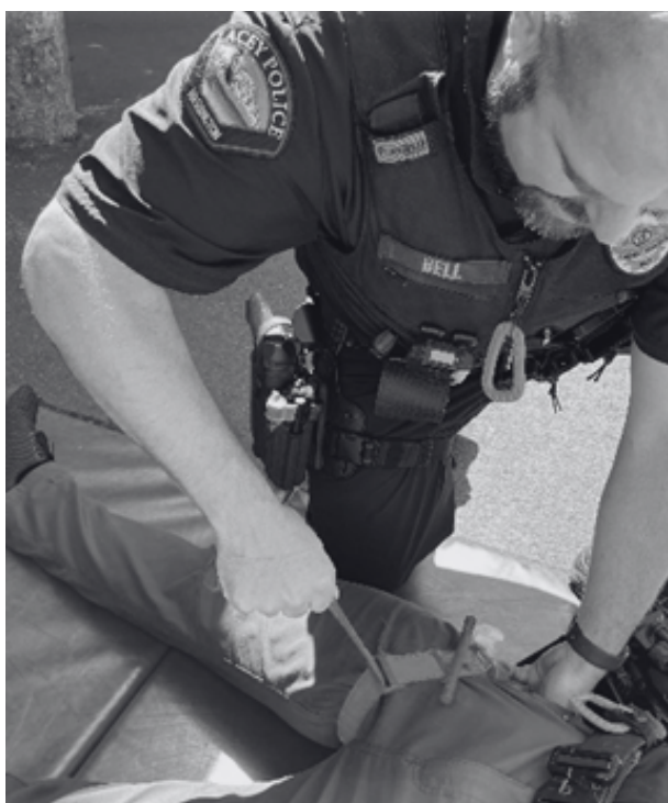
Officer trains in the application of the tourniquet

To address the staffing and financial challenges law enforcement agencies face when sending personnel to the 80-hour PTI course, the ASTD Patrol Tactics team is exploring ways to reduce these impacts while enhancing the course's value. One approach recently approved is waving the 40-hour Instructor Development (ID) training requirement for graduates of the 80-hour PTI training. Instructor Development is mandatory to become a WSCJTC Certified Instructor for tiers two and above. After careful review of the PTI curriculum, it was determined that there was enough ID elements embedded in the PTI training to warrant a waiver. Additional requirements would still need to be met to obtain full WSCJTC Instructor Certification.