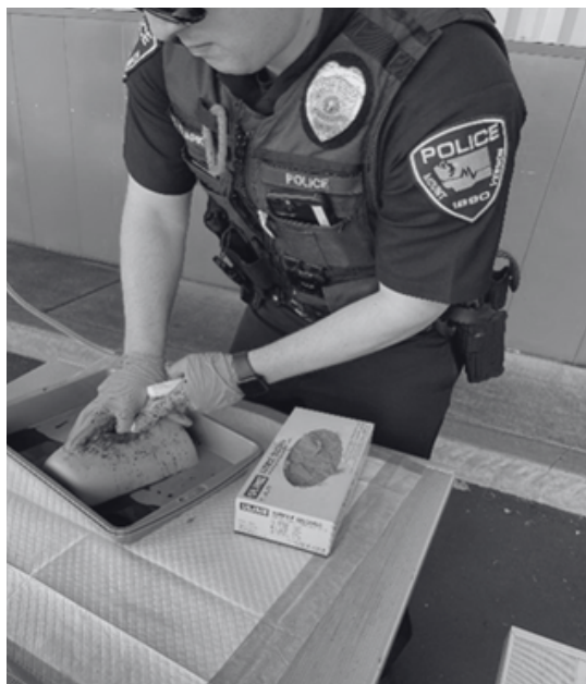
Mt. Vernon Officer uses gauze to learn wound packing during critical lifesaving skills training.